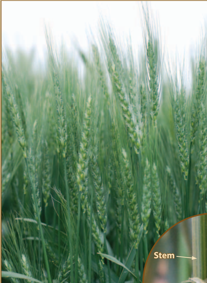
Figure 1. The diagnosis of rust diseases requires some basic understanding of plant anatomy and a quick review of this information may improve the accuracy of the identification process.

depends on host susceptibility and weather conditions, but the loss also is influenced by the timing and severity of disease outbreaks relative to crop growth stage. The greatest yield losses occur when one or more of these diseases occur before the heading stage of development. Early detection and proper identification are critical to in-season disease management and future variety selection.