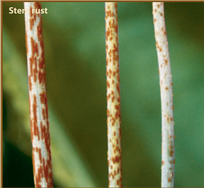
Figure 3. Examples of the variability in symptoms caused by stem rust (below), leaf rust (upper right) and stripe rust (lower right) as a result of unique interactions with wheat or barley varieties.

All three diseases have unique interactions with common varieties of wheat and barley. These interactions can modify the disease symptoms resulting in reduced lesion size and varying amounts of yellow or tan tissue surrounding the lesions (Figure 3). Becoming familiar with the range of possible symptoms for these diseases will improve the accuracy of the diagnosis and the management of these economically important diseases.